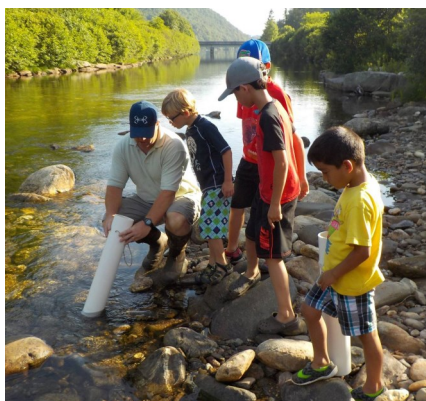
Programs like Trout Unlimited Rivercourse and Lake Logan Summer Adventure Day Camp provided opportunities for children to experience the outdoors in new ways.