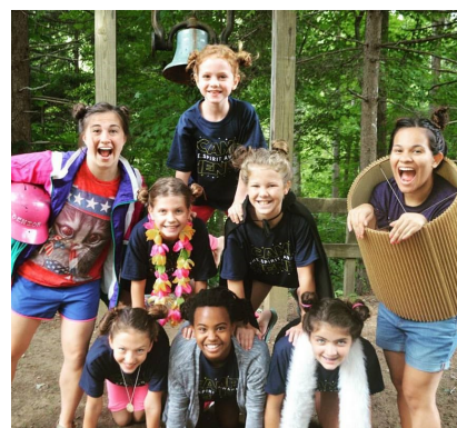
Camp Henry had another spirit-filled summer at Lake Logan. The summer camp theme was Star Wars: The Spirit Awakens.