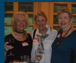
Retreats for a Retreat 2016 brought Lake Logan friends together and raised over $40,000 for ministry!