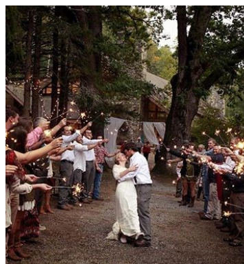
There's really nowhere prettier than Lake Logan for a wedding. We hosted five weddings in 2016.