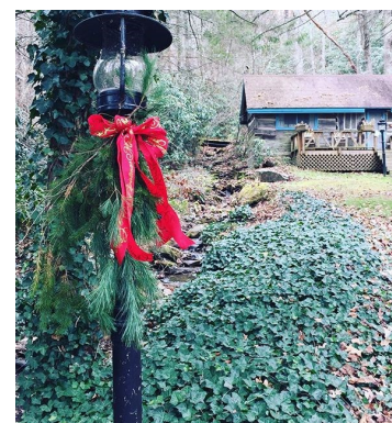
Lake Logan hosted several Christmas events, including a Christmas Tea that collected mittens for children in Haywood County.