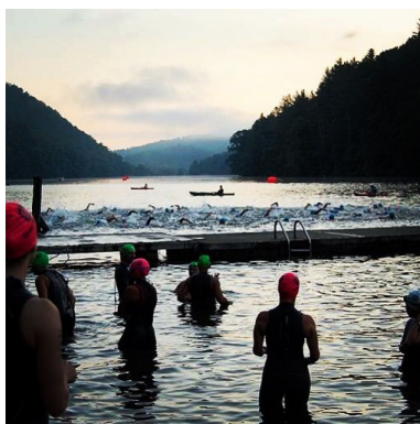
For ten years, the Lake Logan Multisport Festival, held in August, has brought in 1000 visitors annually to Lake Logan.